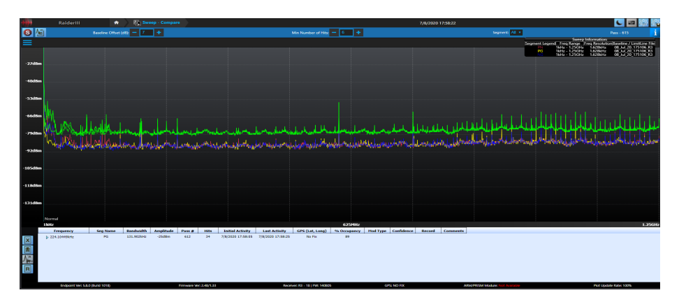
Quickly Scan 3-States of Power Line Conductors (CTL-SW Sensor Sweep w/PLA II)