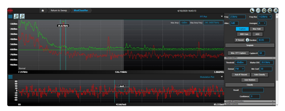
Analyze Detected Power Line Signals (CTL-SW Sensor Interactive Plot w/PLA II)